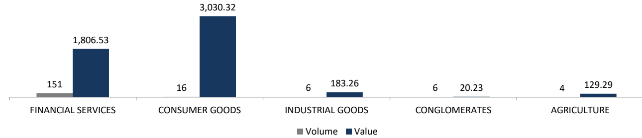
FIVE MOST ACTIVE SECTOR BY VOLUME AND VALUE ('million')