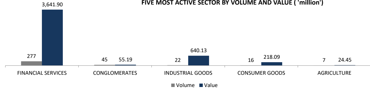
FIVE MOST ACTIVE SECTOR BY VOLUME AND VALUE ('million')